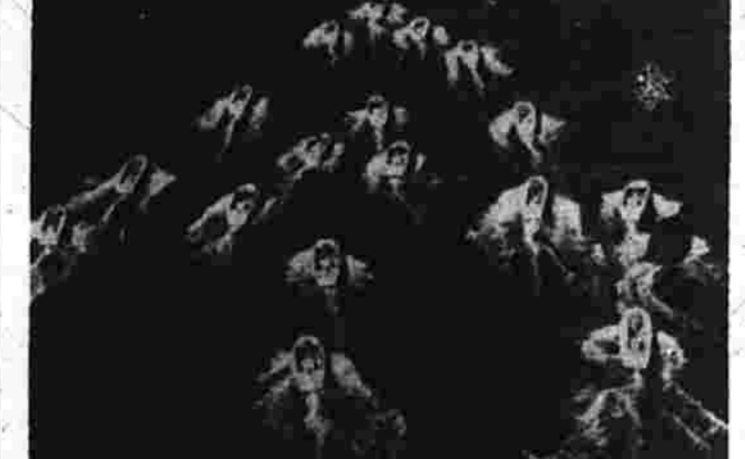
Broad-nosed, self-powered landing boats, built for the United States Army and Navy, were tested in formation on Lake Ponchartraine, Louisiana.